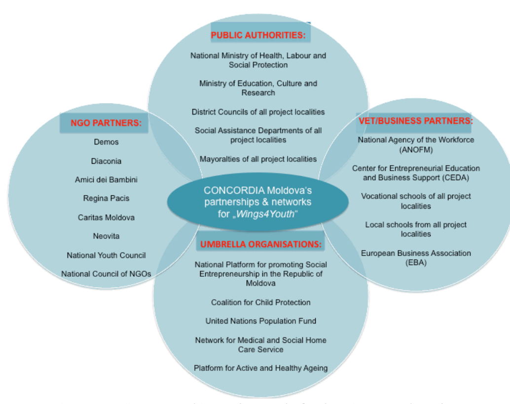
Figure 3: Active partnerships and networks for the Wings4Youth-project